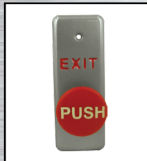
NMDY40 1 switch SPDT momentary, 1-5/8" (40mm) Red Button, "PUSH" ICON & "EXIT" Faceplate ICON with Red Letters and BHMA 689 finish.