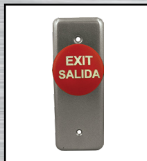
NMSY40 1 switch SPDT momentary, 1-5/8" (40mm) Red Button, "EXIT" & "SALIDA" Button ICON with White Letters and plain Faceplate with BHMA 689 finish.