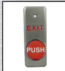
NMDY41 1 switch SPDT momentary, 1-5/8" (40mm) Protected Red Button, "PUSH" ICON & "EXIT" Faceplate ICON with Red Letters and BHMA 689 finish.