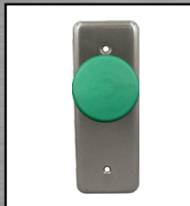
NMX40 1 switch SPDT momentary, 1-5/8" (40mm) Green Button, Plain Faceplate with BHMA 689 finish.