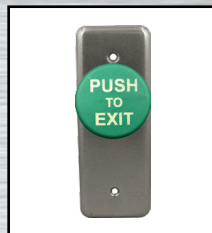
NMPX40 1 switch SPDT momentary, 1-5/8" (40mm) Green Button, "PUSH TO EXIT" Button ICON with White Letters and plain Faceplate with BHMA 689 finish.