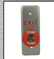
NMDY42 1 switch SPDT momentary, 1-5/8" (40mm) Red Button with Maintained Switch function with Key Release, "PUSH" ICON & "EXIT" Faceplate ICON with Red Letters and BHMA 689 finish.