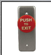
NMPY40 1 switch SPDT momentary, 1-5/8" (40mm) Red Button, "PUSH TO EXIT" Button ICON with White Letters and plain Faceplate with BHMA 689 finish.