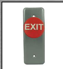
NMEY40 1 switch SPDT momentary, 1-5/8" (40mm) Red Button, "EXIT" Button Icon with White Letters and Plain Faceplate with BHMA 689 finish.