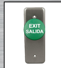
NMSX40 1 switch SPDT momentary, 1-5/8" (40mm) Green Button, "EXIT" & "SALIDA" Button ICON with White Letters and plain Faceplate with BHMA 689 finish.