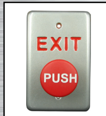
SMDY40 1 switch SPDT momentary, 1-5/8" (40mm) Mushroom Red Button, "PUSH" Button & "EXIT" Faceplate ICON's with Colored Letters and BHMA 689 finish.