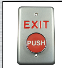
SMDY41 1 switch SPDT momentary, 1-5/8" (40mm) Protected Red Button, "PUSH" Button & "EXIT" Faceplate ICON's with Colored Letters and BHMA 689 finish.