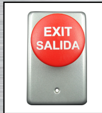
SMSY60 1 switch SPDT momentary, 2-3/8" (60mm) Red Button, "EXIT SALIDA" Button ICON with White Backfill, Plain Faceplate with BHMA 689 finish.