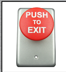
SMPY60 1 switch SPDT momentary, 2-3/8" (60mm) Red Button, "PUSH TO EXIT" Button ICON with White Letters, Plain Faceplate with BHMA 689 finish.