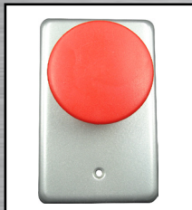
SMY60 1 switch SPDT momentary, 2-3/8" (60mm) Mushroom Red Button, Plain Faceplate with BHMA 689 finish.