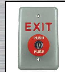
SMLY42 1 switch SPDT momentary, 1-5/8" (40mm) Mushroom Red Button with Maintained Switch function with Key Release including "PUSH" Button & "EXIT" Faceplate ICON's with Colored Letters and BHMA 689 finish.