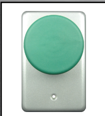
SMX60 1 switch SPDT momentary, 2-3/8" (60mm) Mushroom Green Button, Plain Faceplate with BHMA 689 finish.