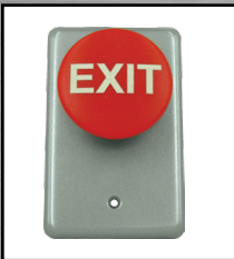
SMEY60 1 switch SPDT momentary, 2-3/8" (60mm) Red Button, "EXIT" Button ICON with White Letters, Plain Faceplate with BHMA 689 finish.