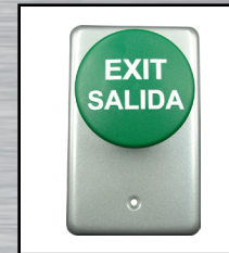
SMSX60 1 switch SPDT momentary, 2-3/8" (60mm) Green Button, "EXIT SALIDA" Button ICON with White Backfill, Plain Faceplate with BHMA 689 finish.